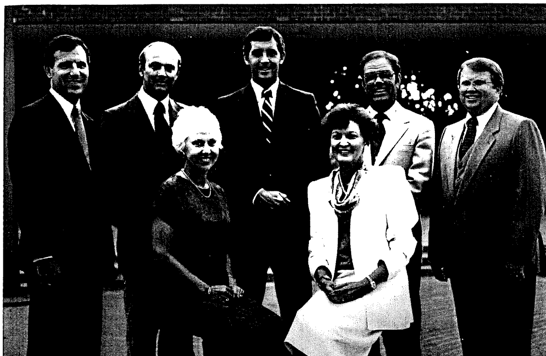
Lewisville ISD Board of Trustees